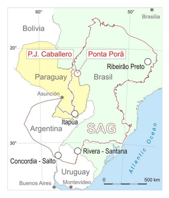
Figure 1: General location map

After the finalisation of the SAG-GEF project in 2009, international agreements have been approved to promote future SAG groundwater initiatives, including the creation of a regional groundwater institute by the Mercosur Parliament in November 2009 (INRA-Mercosur) with specific reference to the shared management of the SAG. And consequently, in August 2010 the agreement about the responsibility for a common and sustainable management (acuerdo sobre el Acuífero Guaraní) has been signed by the four SAG participating countries Argentina, Brasil, Paraguay and Uruguay.